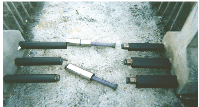
SpliceSeal at San Mateo Bridge job site. Specified by CalTrans (see QPL 09/03). Headed Reinforcement couplers shown.